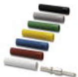
Insulating sleeve, Color: yellow